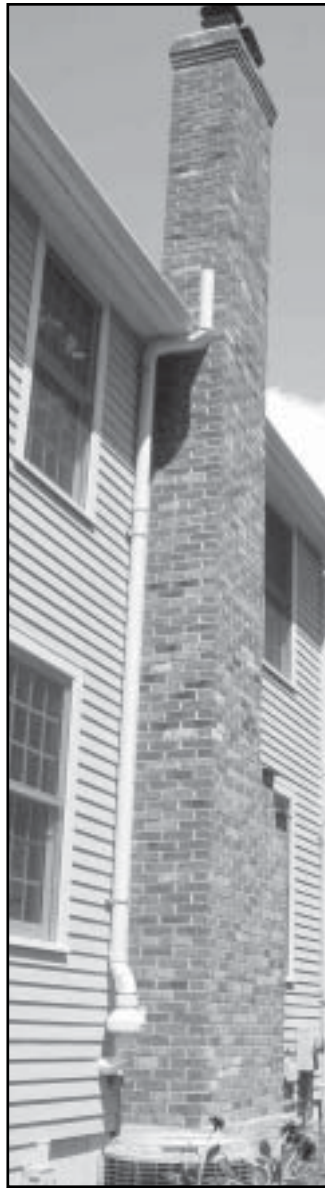
Example of vent pipe installation.